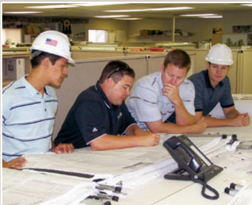
At Construction Tech Academy, students explore construction, architecture and engineering through a contextual, hands-on, rigorous curriculum that prepares them for direct entry into colleges, apprenticeships or careers.